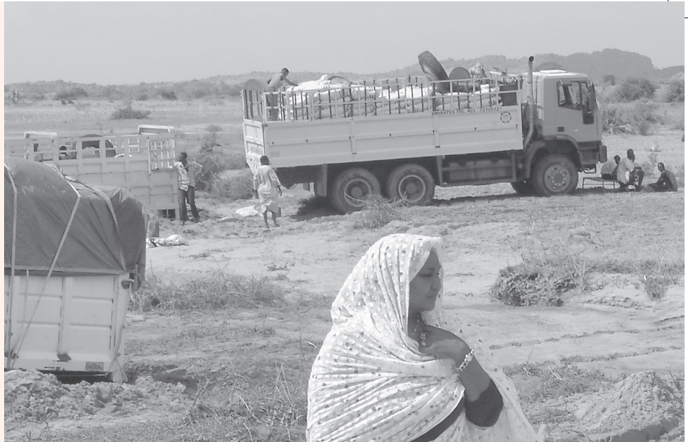
With your support, we can load trucks like these with emergency food aid for families in Darfur.

Today, as a union, the women can rent land and lobby for storage space in a national seed storage warehouse, something they could not do individually. Their vision is to be able to feed the hungry of their nation without international food aid. Today, MADRE is sponsoring the Women Farmers' Union's first program to grow food to send to hungry families in Darfur. There's no better way to truly support the women and families of Sudan. We hope that you will be our partner in this worthy endeavor.